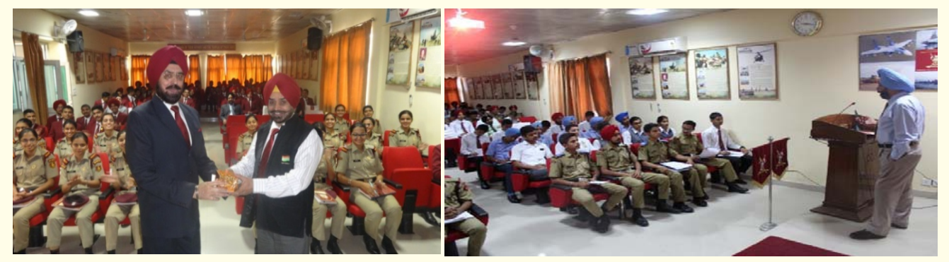
ART OF STUDY SEMINAR