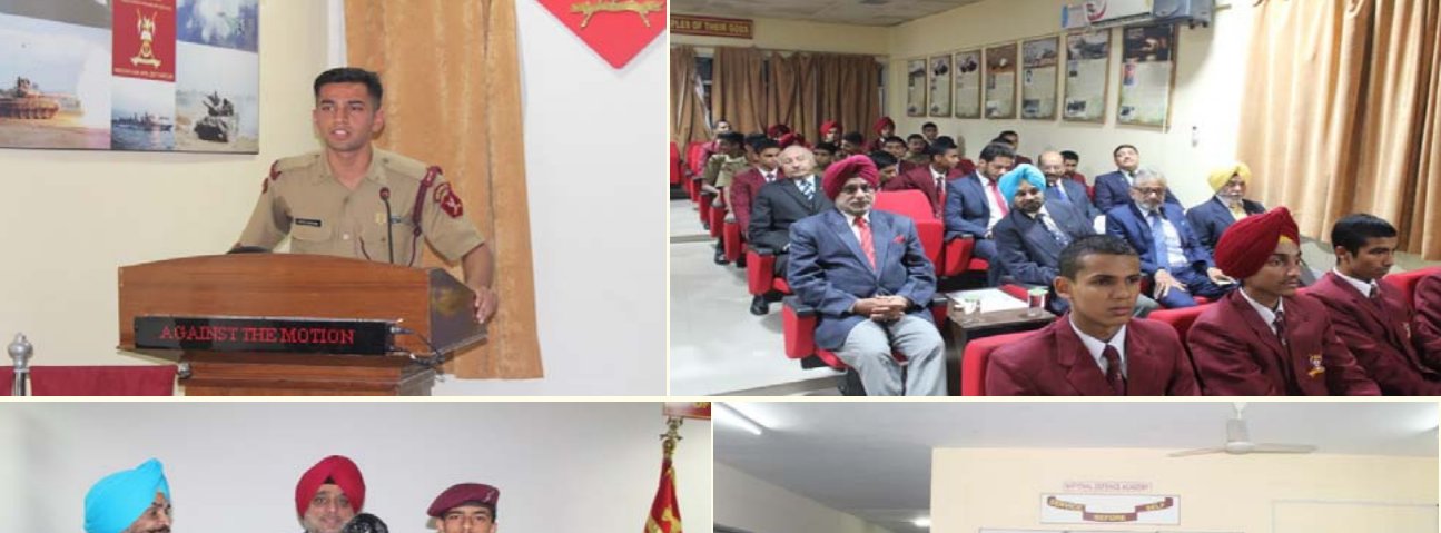
COMMUNICATION SKILLS SEMINAR