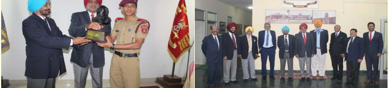
INTER SQN 5^{TH} AND FINAL DEBATE